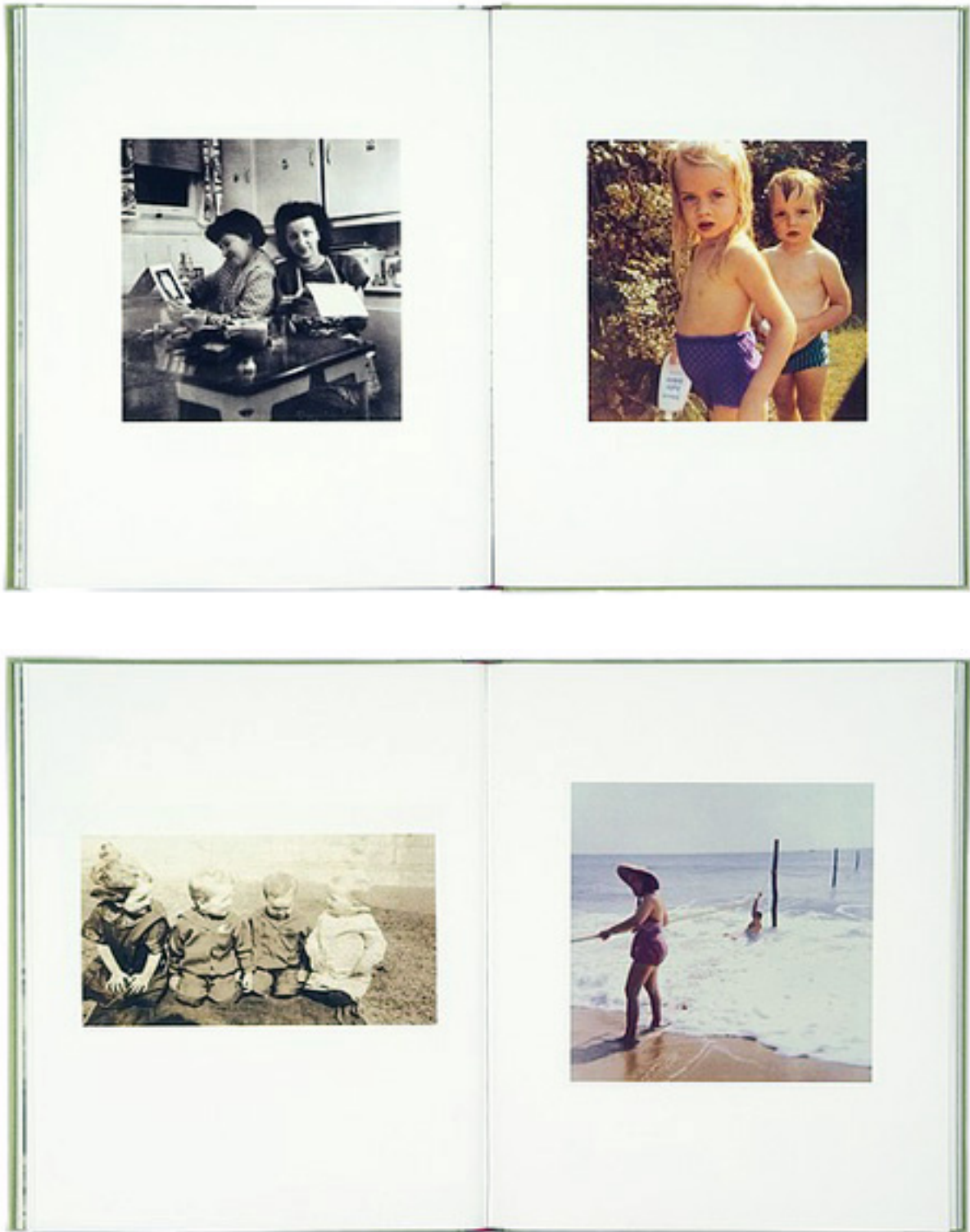
Fig. 1. Tacita Dean, Floh, 2001. Photo-album.